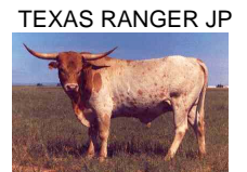
TEXAS RANGER JP