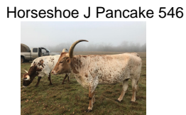
Horseshoe J Pancake 546