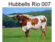
Hubbells Rio 007