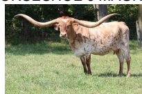
HORSESHOE J MAGNIFY