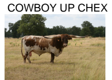
COWBOY UP CHEX