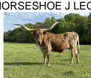
HORSESHOE J LEGIBLE