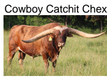
Cowboy Catchit Chex