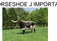
HORSESHOE J IMPORTANT