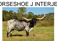
HORSESHOE J INTERJECT