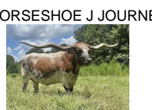
HORSESHOE J JOURNEY