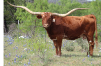
TEXANA GARLAND'S GAL