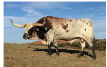
KC JUST RESPECT