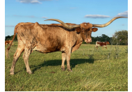
GT HEY JUDE HEY