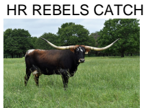
HR REBELS CATCH