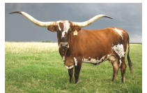
SHAMROCK MIKES ROSE