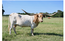
HR SLAM'S ROSE