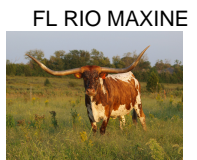
FL RIO MAXINE