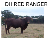
DH RED RANGER