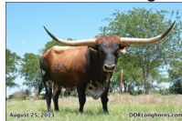
DDR Rio Ranger