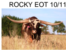
ROCKY EOT 10/11