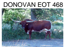
DONOVAN EOT 468