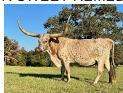
DDR SWEET REMEDY 1008