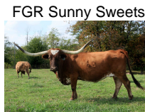
FGR Sunny Sweets