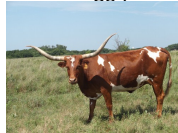
EOT DONOVANS CARMELA 894