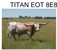
TITAN EOT 8E8