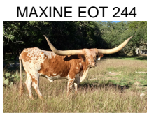
MAXINE EOT 244