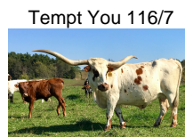
Tempt You 116/7