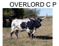
OVERLORD C P