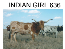
INDIAN GIRL 636