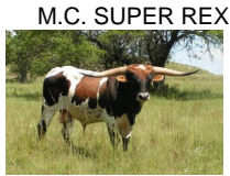
M.C. SUPER REX