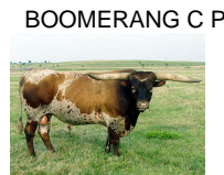
BOOMERANG C P