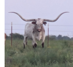
WS SUN STAR