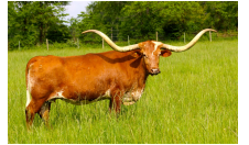
WS SUN RISE