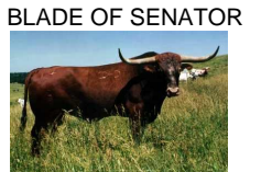
BLADE OF SENATOR