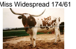
Miss Widespread 174/61