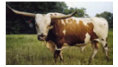
DON JUAN OF CHRISTINE