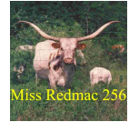
MISS REDMAC 256