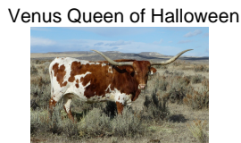
Venus Queen of Halloween