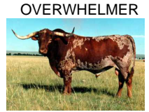
SHE'S A SUPER LADY